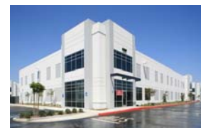
New Hawthorne Location

(424) 675-2600 Phone (424) 456-3844 Fax (888) 454-4489 Toll Free